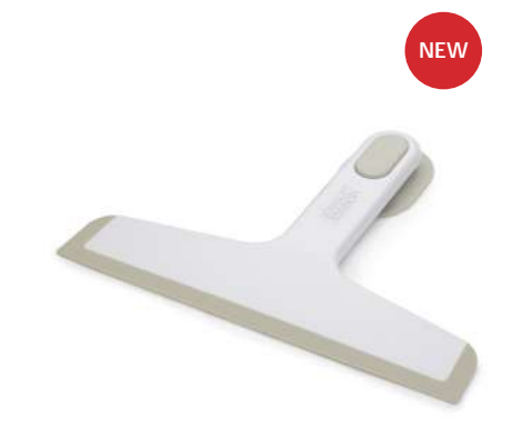
Slimline Squeegee with suction-cup holder 70556