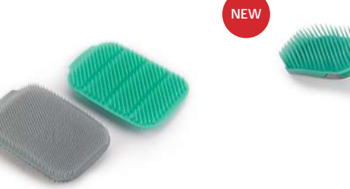
CleanTech™ Washing-up Scrubber (2-pack) 85174