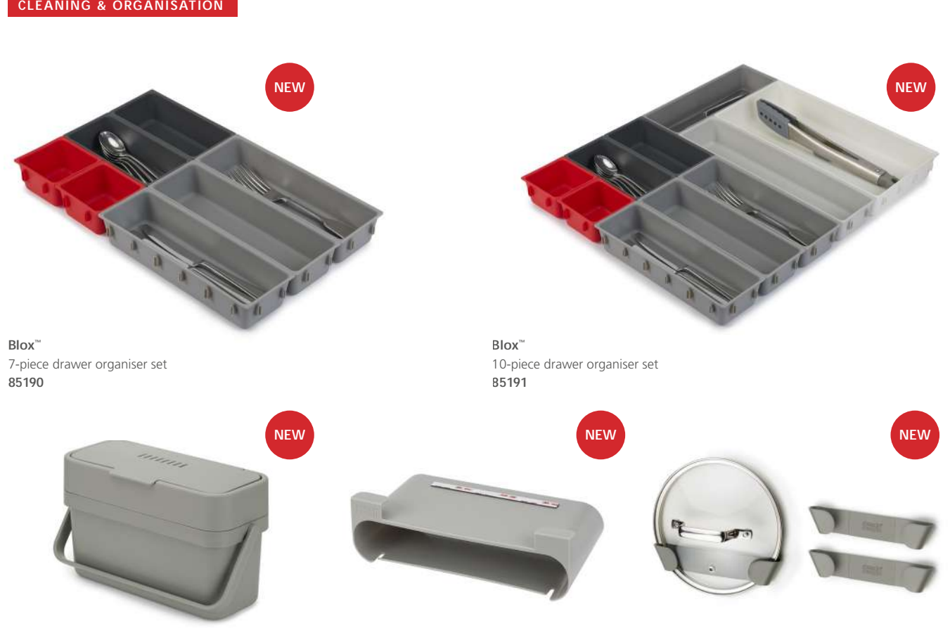
Compo<sup>™</sup> Easy-fill food waste caddy 30117