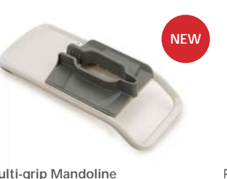
Multi-grip Mandoline 20153