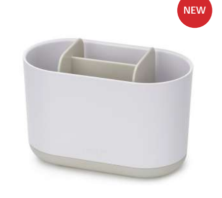
Large Toothbrush Caddy 70553