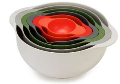
6-piece Food Preparation Bowl Set 80025