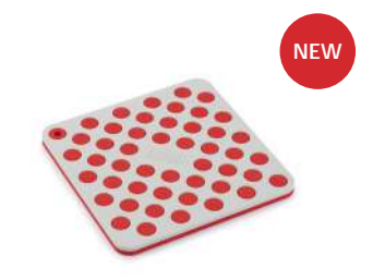
Spot-On™ Set of 2 Silicone Trivets 20163