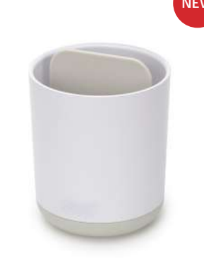
Toothbrush Caddy 70552