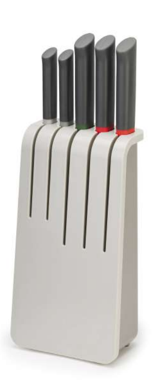
5-piece Knife Block Set 80054