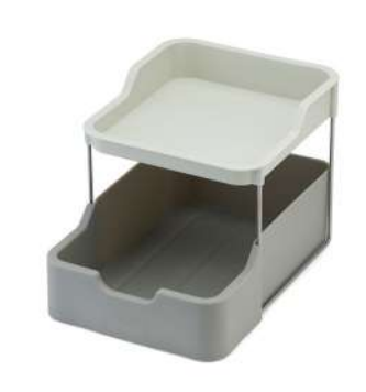
2-tier Cupboard Organiser with drawer 85192