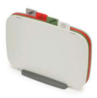
4-piece Chopping Board Set with index-style tabs 80017