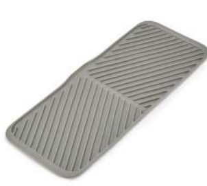
Foldable Drying Mat 80069

Expanding Dish Rack with moveable utensil pot