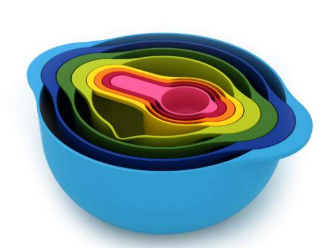
8-piece Food Preparation Set 40104