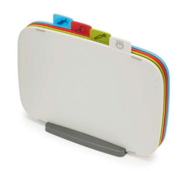
4-piece Chopping Board Set with index-style tabs 60169