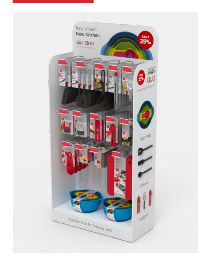
Disposable Floor-standing Merchandiser (Image for reference only)