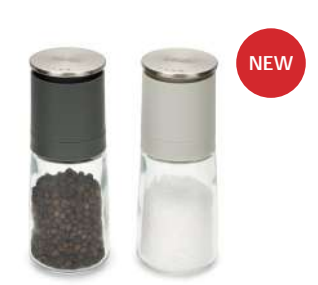
No-Spill Salt & Pepper Set 20164