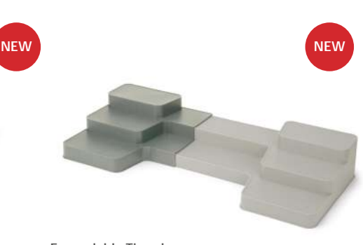
Expandable Tiered Cupboard Organiser 85171