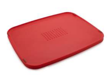
Multi-function Chopping Board with meat grip 80077 - Red