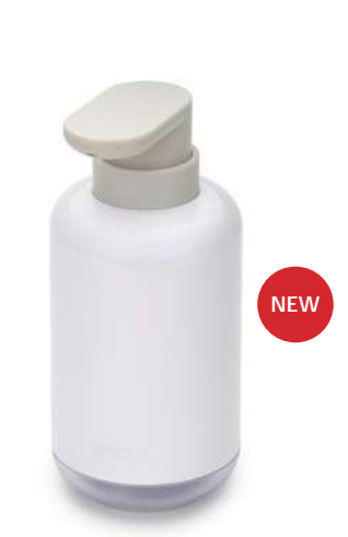
Soap Dispenser 70554