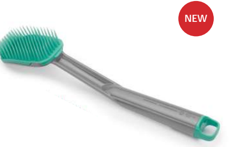
CleanTech™ Washing-up brush 85175