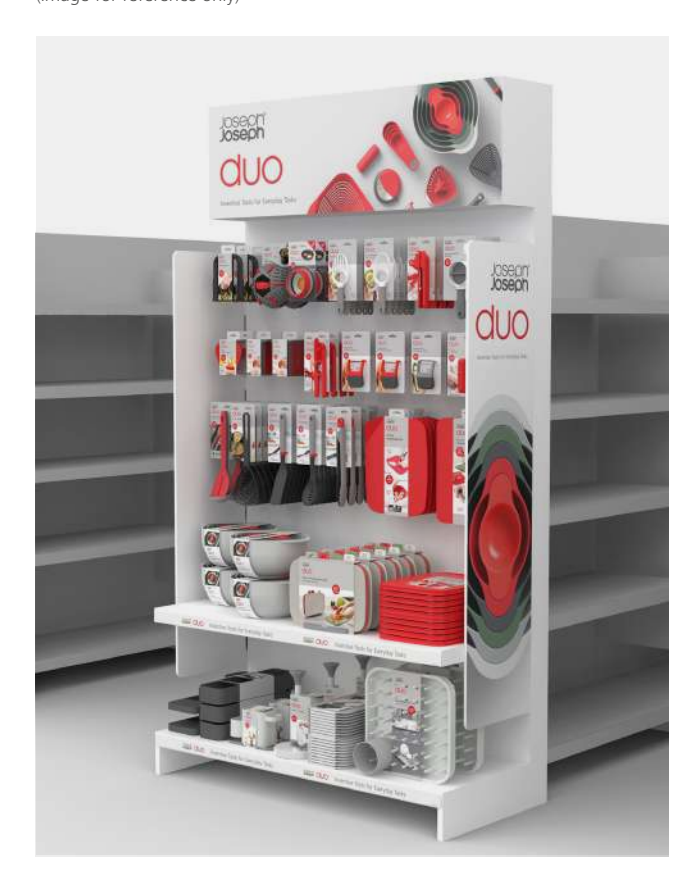
Bay End Display (Image for reference only)