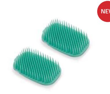
CleanTech™ Washing-up Brush Replacement Heads (2-pack) 85176