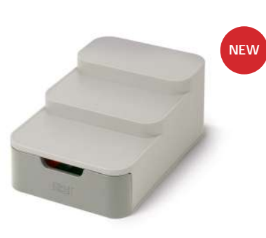
Compact Cupboard Organiser with drawer 85172