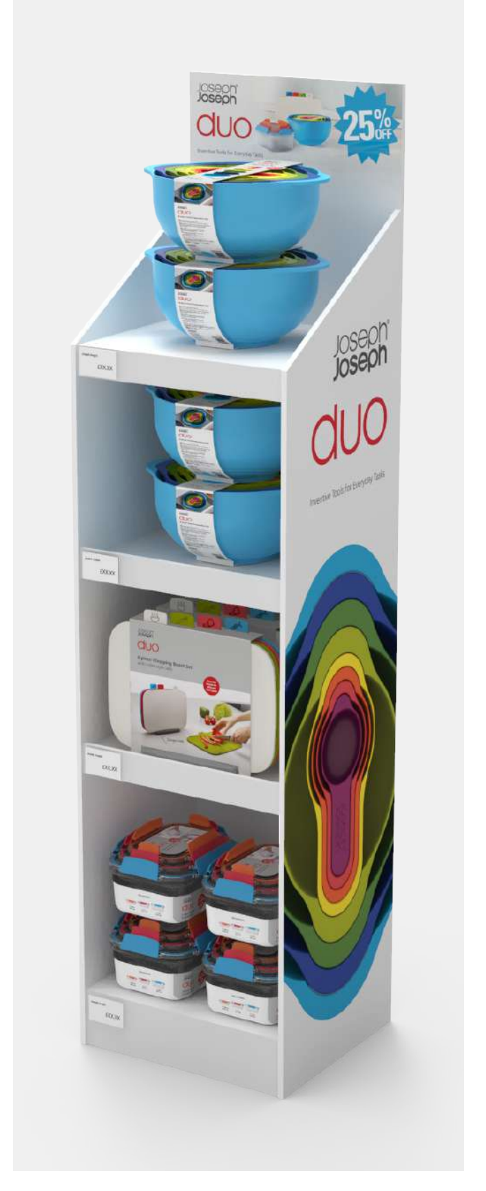
Promotional Range Disposable Floor-standing Merchandiser (Image for reference only)