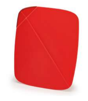
Folding Chopping Board 80018 - Red