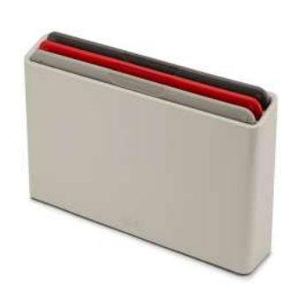
3-piece Chopping Board Set with storage case 60179