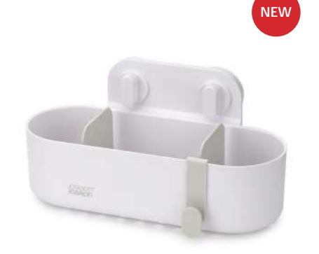
Shower Caddy with dividers 70557