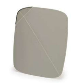
Folding Chopping Board 80019 - Grey