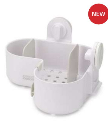
Corner Shower Caddy with dividers 70558