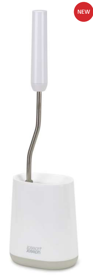
Flex™ Lite Toilet brush 70559