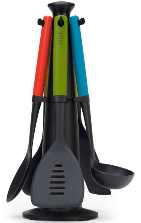
5-piece Utensil Set with storage stand 10534