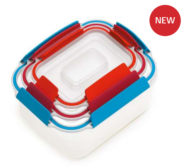
3-piece Storage Container Set 81115