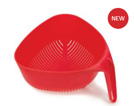
Triangular Colander with easy-pour corners 20160